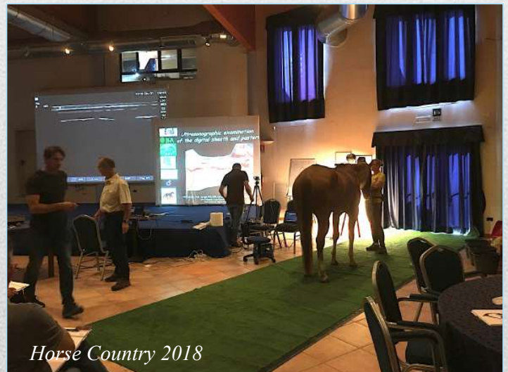
Horse Country 2018

HORSE COUNTRY RESORT CONGRESS & SPA STRADA A MARE 24 ARBOREA (OR)